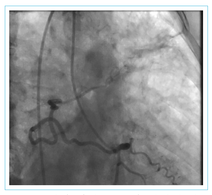
Figure 1. (a) A plexiform fistula originating from the developed conus branch of the right coronary artery and extending to the left pulmonary artery.