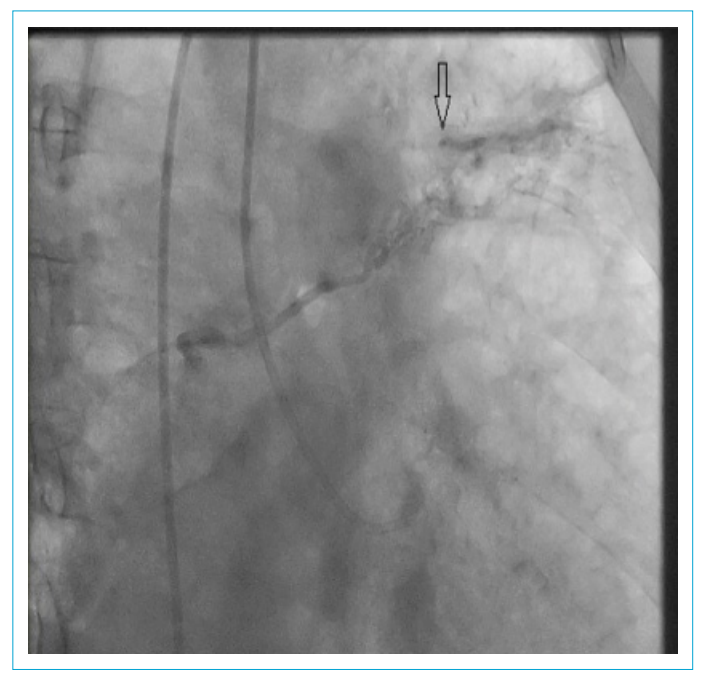
Figure 1. (b) Distal flow image of coronary-pulmonary artery fistula (about 2 mm diameter) originating from the developed conus branch of the right coronary artery and extending to the left pulmonary artery (arrow).